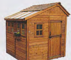
OUTDOOR LIVING TODAY

The Seattle firm's answer to a backyard storage shed is this sleek and sustainable steel and ipe structure with sliding doors and a green roof. shedbuilt.com