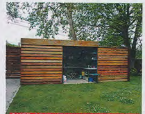
SHED ARCHITECTURE AND DESIGN

This West Coast company's prefab Modernist modules, including the 117-square-foot K3, shown here, are more Lautner than lean-to. kithaus.com